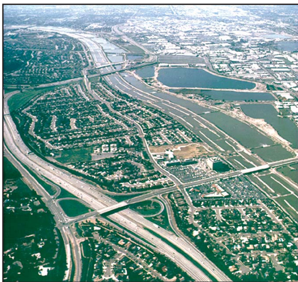
Orange County Water District facilities along the channel of the Santa Ana River