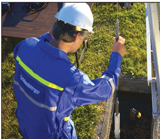
Accessing the multilevel Westbay System with portable wireline equipment.